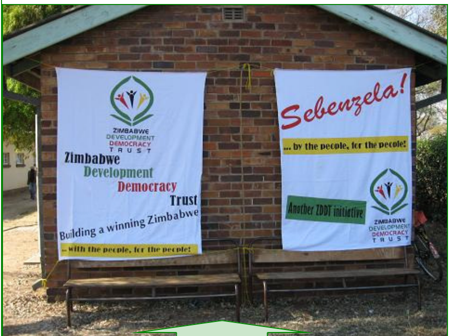
The new ZDDT & Sebenzela banners